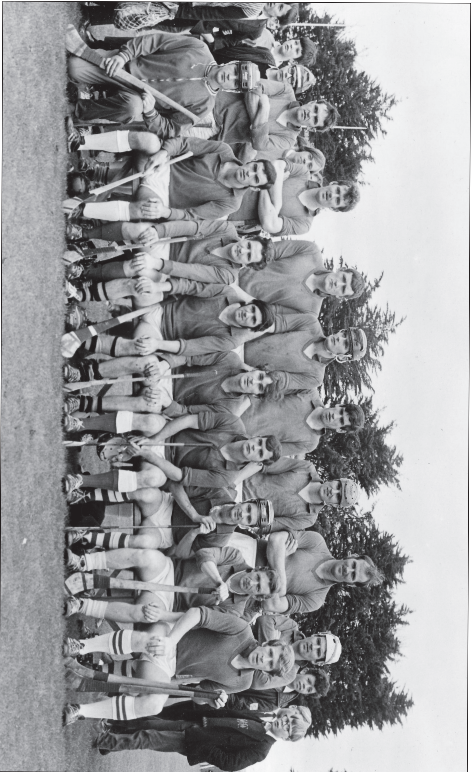
James Stephens County SH Finalists 1970