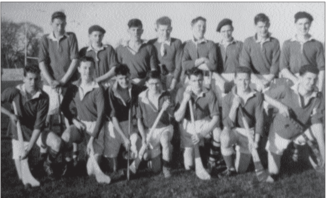
Fenians 1960 County Minor Finalists

1970, however, was to be a different story.