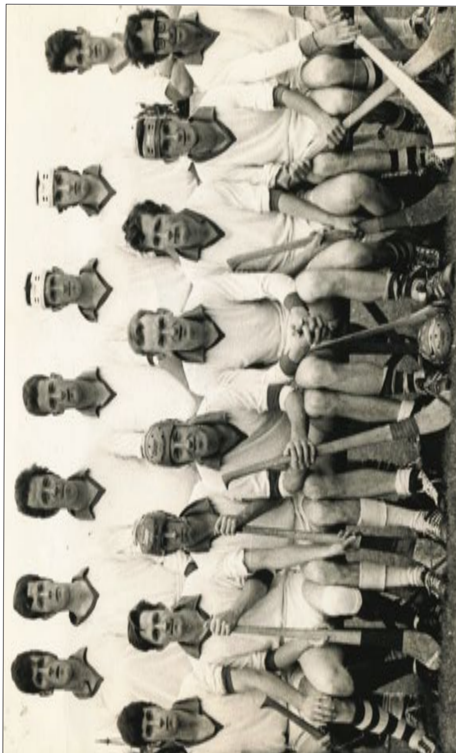
The Fenians - 1970 County Senior Hurling Champions