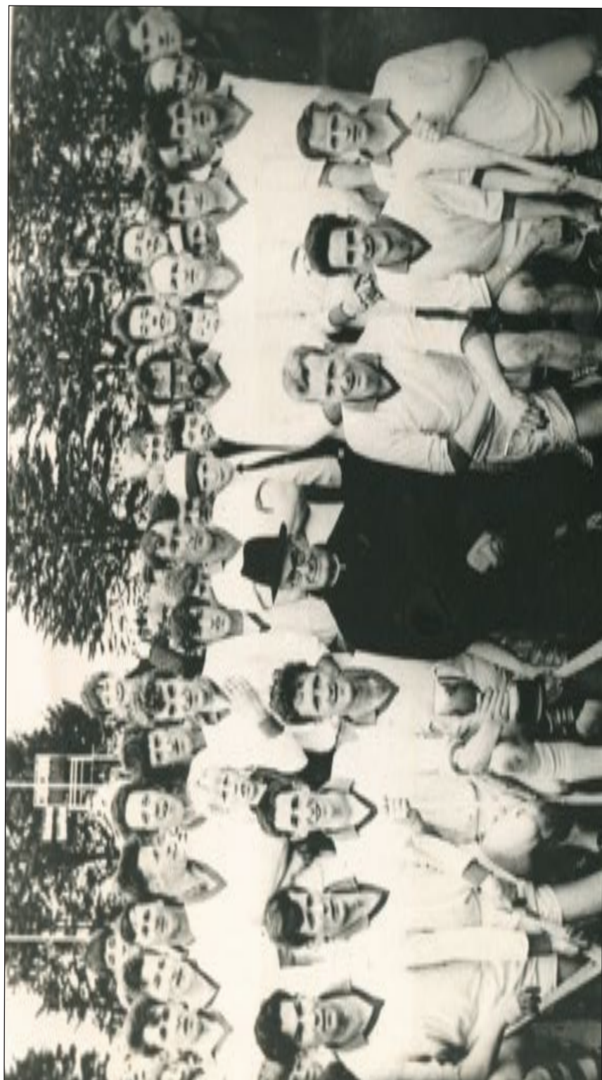
The Fenians - 1968 Co Junior Hurling Champions