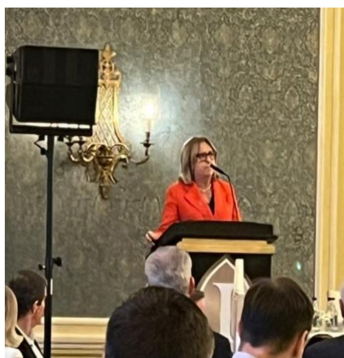
Above and previous page, a selection of photos from the inaugural Black and Amber Forum.