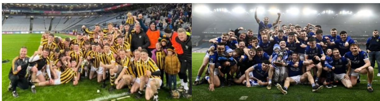
The Tullagher Rosbercon and Thomastown Teams Celebrate their All Ireland Victories

With the final score-line reading Thomastown 2-23, Castlelyons 0-13, Thomastown are the eighth Kilkenny team to claim the All-Ireland Intermediate crown. They now have an opportunity to make an impact at the senior grade.